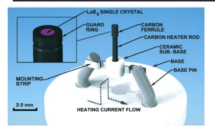
Fig. 1 ES-423GR Guard Ring LaB<sub>6</sub> Single Crystal Cathode on AEI Base