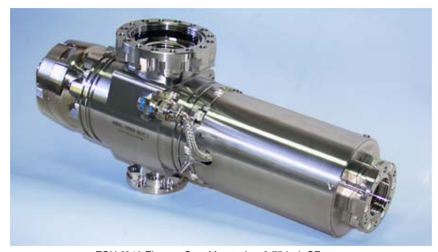
EGH-6210 Electron Gun Mounted on 2.75 inch CF. Optional Turbo Pump and Ion Gauge not shown

The gun design provides for differential pumping of the Source region with a 4\frac{1}{2} inch CF flange on the source chamber for attachment for a Turbo pump and a 2\frac{3}{4} inch CF flange for an ionization gauge. The gun is usually mounted on a 2\frac{3}{4} inch CF flange and has zero insertion distance, i.e. does not extend into the vacuum chamber. Due to the high power beam produced by the EGH-6210, X-ray shielding is essential.