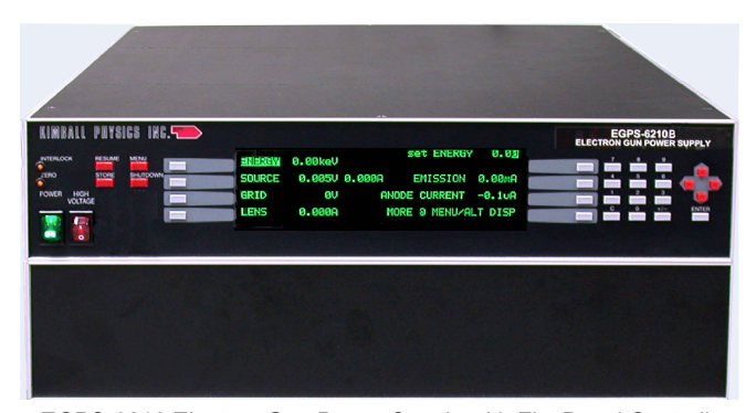
EGPS-6210 Electron Gun Power Supply with FlexPanel Controller

An optional LabVIEW<sup>TM</sup> computer program designed for the EGH-6210 is available for remote computer control and metering. Software is available in two types: Using National Instrument DAQ boards and SCSI connectors on the EGPS-6210, or via a simple serial connector interface. The program provides a virtual panel of controls and real-time metering on the user's computer screen.