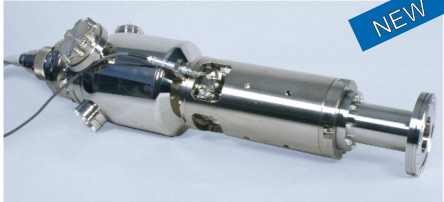
EGH-8201 Electron Gun Mounted on 6CF Flange

The gun design provides for differential pumping of the Source region with a 4\frac{1}{2} CF flange on the source chamber for attachment for a Turbo pump and a 2\frac{3}{4} CF flange for an ionization gauge. The gun is usually mounted on a 6 inch CF flange and has zero insertion distance, i.e. does not extend into the vacuum chamber. Due to the high power beam produced by the EGH-8201, X-ray shielding is essential.