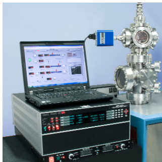
A typical lab set-up of a complete Kimball Physics system with power supplies, electron gun, and optional computer control system