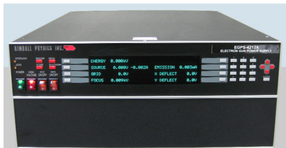
EGPS-4212A Electron Gun Power Supply with FlexPanel controller

An optional LabVIEW™ computer program designed for the EMG-4212 is available for remote computer control and metering using National Instrument DAQ boards and SCSI connectors on the EGPS-4212. The program provides a virtual panel of controls and meters on the user's computer screen.