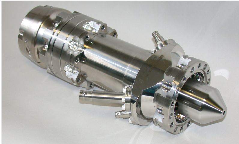
EMG-4215A Electron Gun with 4½ inch CF mounting flange

NEW MODULAR DESIGN INTERNAL ALIGNMENT WHILE OPERATING COLLIMATED BEAM SPOT SIZE DOWN TO 500 \mu\text{m} MEDIUM BEAM CURRENTS UP TO 5 mA ELECTROSTATIC FOCUSING & DEFLECTION UHV COMPATIBLE / BAKEABLE COMPUTER / REMOTE CONTROL USER-REPLACEABLE FIRING UNITS