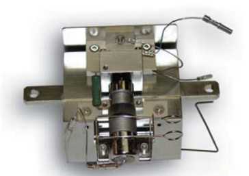
Agilent Ion Optics MAGNUM